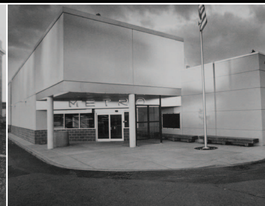
Metro Training Center 1978-1998