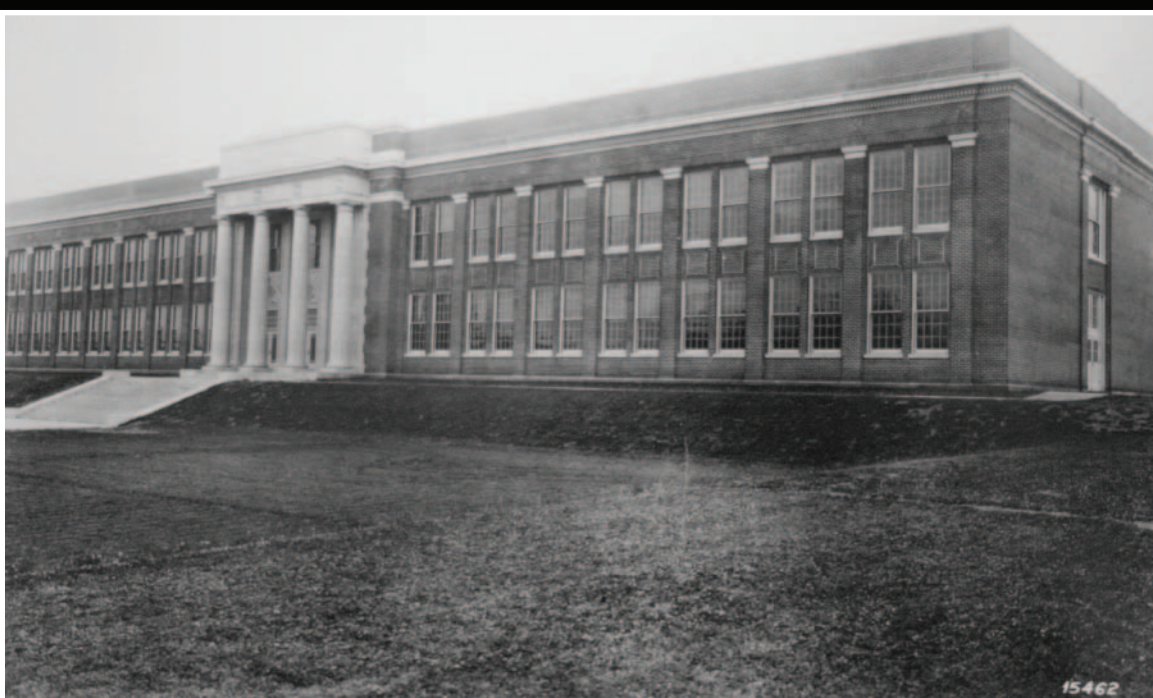
Benson High School 1955-1978