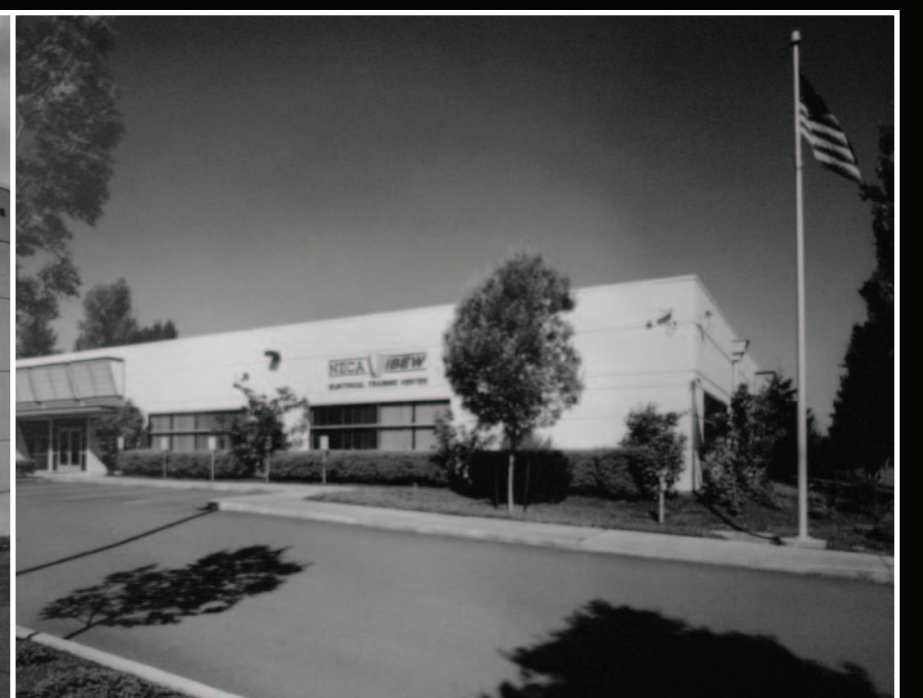
NECA/IBEW Electrical Training Center 1998-Present