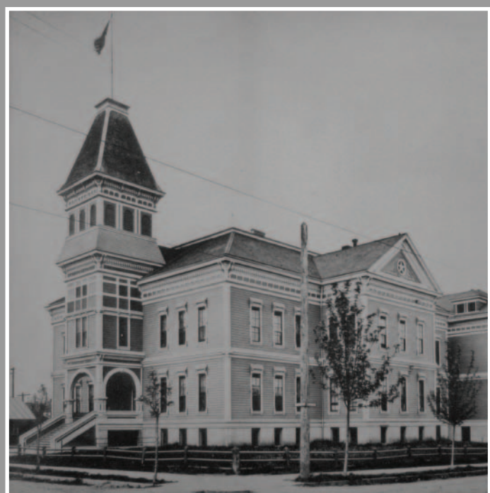
Stephens School 1929-1938